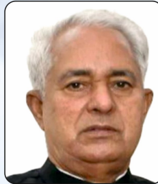
Shri Prasadi Lal Meena Hon'ble Cabinet Minister, Medical and Health Department Government of Rajasthan