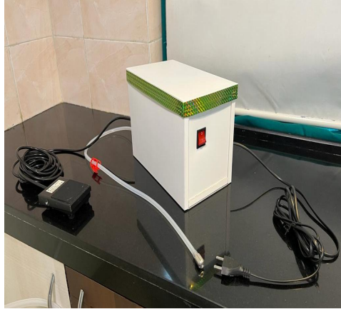
Assembly of EIAE